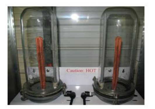
Side-By-Side Test Stand

As proven at independent testing facilities Filtersorb SP3 will prevent calcium scale formation. Tests were performed using side-by-side glass vessels with heating elements (heated to 180°F) to simulate performance of a hot water heating system. Water, with 16-17 grains of hardness, was treated at specific flow rates. The testing proves that Filtersorb SP3 Anti-Scale Media prevents scale formation and "de-scaling" was observed after only 3 weeks of treatment.