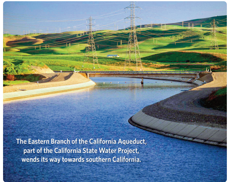
The Eastern Branch of the California Aqueduct, part of the California State Water Project, wends its way towards southern California.

To ensure that tap water is safe to drink, the U.S. EPA and DDW prescribe regulations that limit the amount of certain contaminants in water provided by public water systems. U.S. Food and Drug Administration regulations and California law also establish limits for contaminants in bottled water that provide the same protection for public health. Drinking water, including bottled water, may reasonably be expected to contain at least small amounts of some contaminants. The presence of contaminants does not necessarily indicate that water poses a health risk.